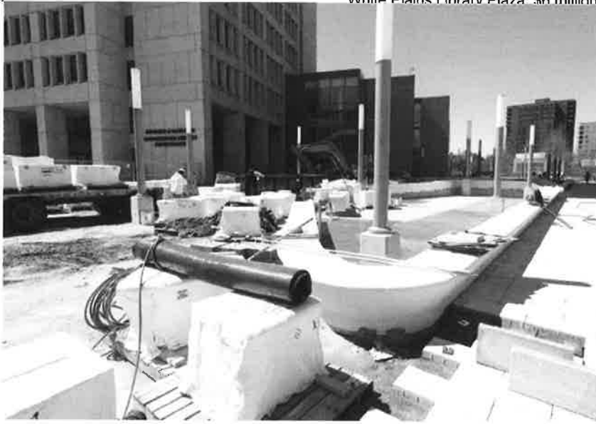
"Seat walls" are pictured as work continues on a multi-million dollar renovation of the White Plains Library Plaza, April 24, 2019.