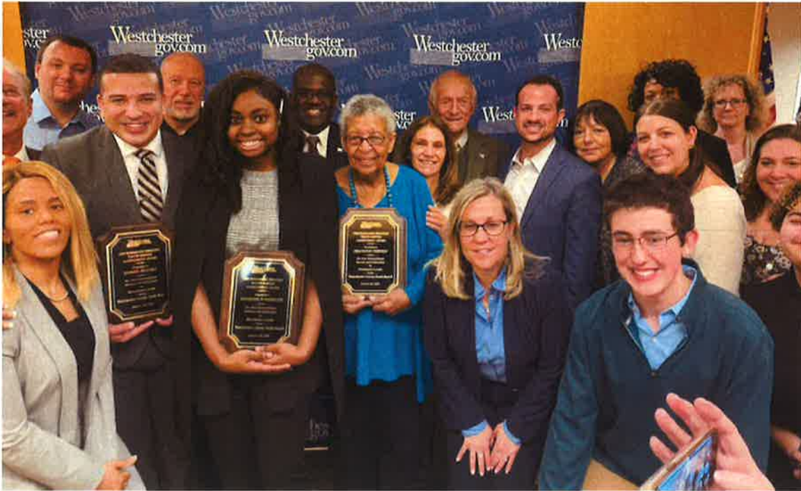
Winners and Attendees at Siragusa Awards